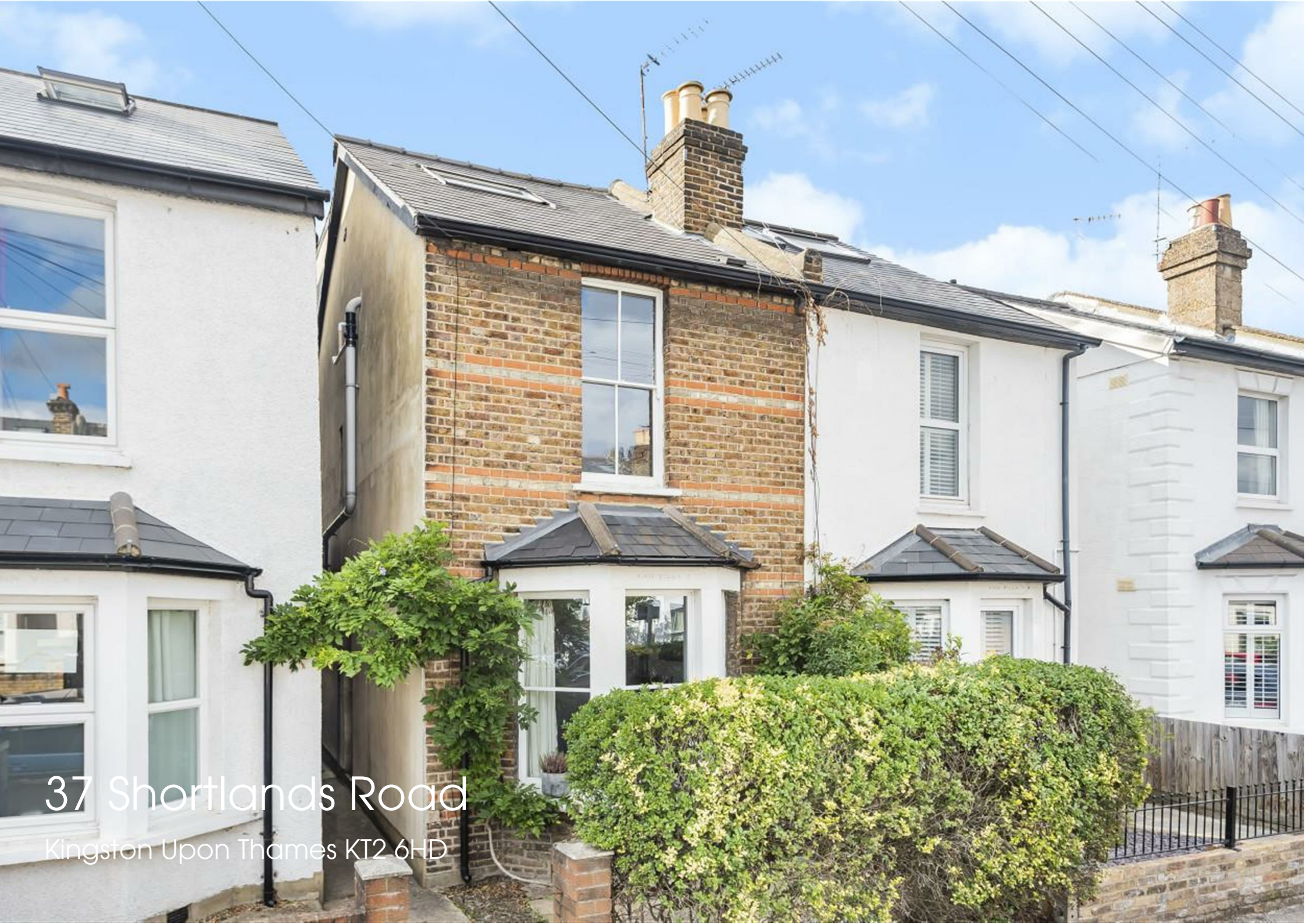
37 Shortlands Road Kingston Upon Thames KT2 6HD